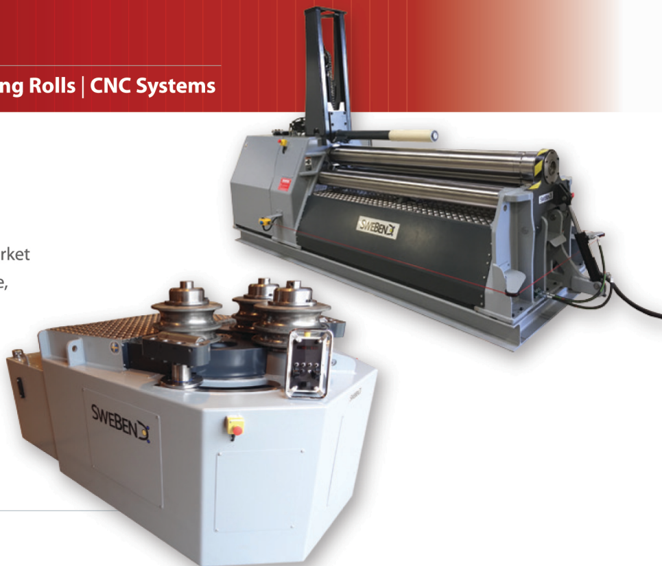
Plate Bending Rolls Angle Bending Rolls