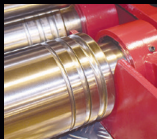
Round Bar Grooves