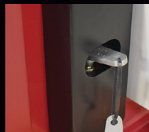
Pinch Gap Control