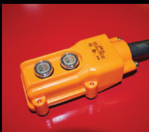
Hand-Held Rotation Control